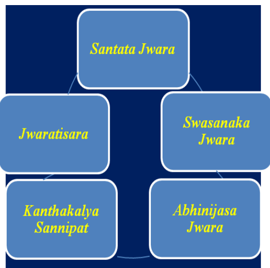
Figure 2: Some Jwara which needs immediate attention.