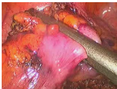
Image 3: Intracorporeal resection of proximal rectum.