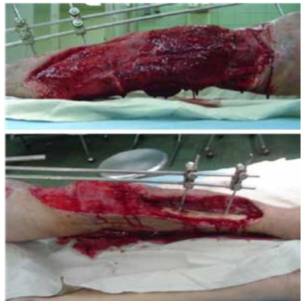
Figure 5: Patient with Open III-c Distal Femur Fracture with popliteal artery injury associated with tibia and fibula fracture who underwent Popliteal Artery Bypass Grafting – note large leg avulsion with exposed tibia. However, it was the Popliteal Artery Bypass Graft that failed at 3 weeks, resulting in amputation.

Next patient was an open type III distal femoral fracture with popliteal artery bypass grafting and associated tibia and fibula fracture. Modified NPWT was set up over the external fixator, extremity developed gangrene due to failure of the popliteal artery bypass after 3 weeks. Patient underwent above knee amputation because of the gangrene. Healthy granulation tissue was observed at the open fracture site. This demonstrated the ability of modified NPWT to stimulate regeneration therefore not truly a failure of the procedure (Figure 5).