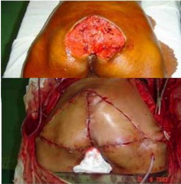
Figure 4: Decubitus ulcer in a 78 year old man. Good granulation tissue bed was achieved after 3 VAC changes. the soft tissue defect was covered using bilateral V-Y Gluteal advancement flaps.

Since infection management was also a purpose of this study, we looked at initial organisms cultured and interestingly found Staphylococcus aureus only three times common. The rest being various gram negative organisms such as Enterobacter , Enterococcus , Klebsiella , Proteus , E. Coli and Pseudomonas . Subsequent culture from repeat debridement yielded only Staphylococcus aureus two times common, rest being gram negative organisms again mostly E. Coli , Enterobacter and Pseudomonas , indicating microbacterial flora in our hospital to be predominantly gram negative.