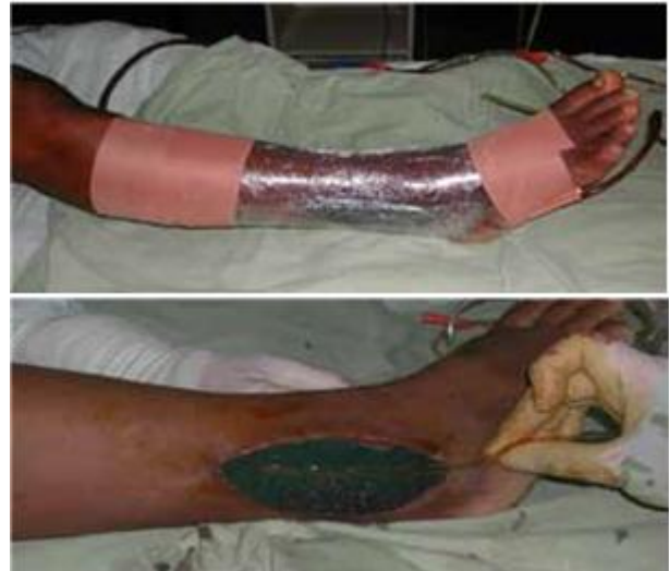
Figure 2: Foam is cut with a metz scissor in the shape of the wound. A Nasogastric tube or an infant feeding tube is placed in a tunnel of the foam. It is then wrapped by saran@wraps. the edges are obliterated by using Leukoplast@ plaster tapes thus making it a sealed dressing.

A pre-sterilized Saran® wrap or Glad® wrap (Ioban®, Steridrap® or any brand of barrier drape) was wrapped around the area. The ends of this seal were then obliterated by applying Leukoplast® plaster tapes thus making it an air tight seal (Figure 2).