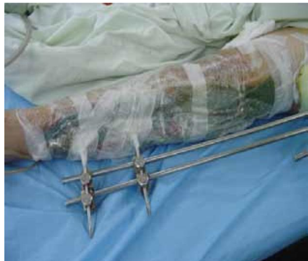
Figure 3: Applying VAC around a external fixator requires an extra effort. the saran@ wrap are slit cut around the pins. Leukoplast@ plaster tapes has to be properly applied around the pins so as to make it a sealed dressing.

The tube was then connected to the suction to check if the foam collapses, if not then we looked for any unsealed area then sealed it with more plaster tapes. In cases of external fixators, slit cuts on the Saran® wraps were made to seal pin sites and tapes around the pin sites sealed the area adequately (Figure 3).