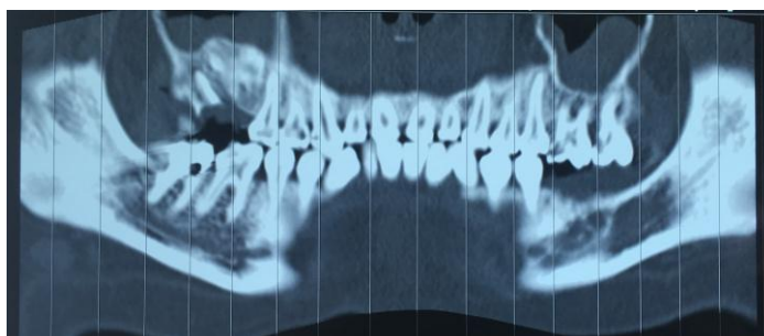
Fig-1: Panoramic radiograph shows a diffuse irregular osteolytic bone destruction in the mandible.

× 35 mm, its edge uneven, and the cortical bone eroded and destroyed (Figure 1). The incisional biopsy of the lesion was performed under local anesthesia. The histopathological examination showed spindle shaped cells. Most tumor cells showed an increasing mitotic activity as well as pleomorphism. Immunohistochemical investigations of tumor cells showed positivity for creatine kinase, vimentin and for EMA. Tumor cells were also focally positive for AE1/3. Based on immunohistochemical findings a diagnosis of Spindle cell carcinoma was made. The patient underwent partial mandibulectomy and mandibular reconstruction using a bridging plate (Figure 2). Histopathology and immunohistochemistry of excised specimen confirmed the diagnosis of Spindle cell carcinoma. Internal and external margins were microscopically involved. The patient did not receive subsequent chemotherapy and postoperative irradiation. Four months later there was a recurrence. A CT scan was performed confirming the recurrence (Figure 3). A re-excision was made followed by adjuvant chemoradiotherapy (66 Gy in 33 daily fractions with concurrent cisplatin chemotherapy 40 mg/m 2 on a weekly basis).