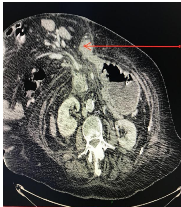
Figure 1: Axial CT image demonstrating a large incisional hernia with the distal stomach, duodenum (arrow) and part of the pancreas within the sac.

The patient was diagnosed with acute pancreatitis. She underwent a CT scan of her abdomen and pelvis to exclude a sub-acute intestinal obstruction secondary to the hernia. The CT scan confirmed the presence of acute pancreatitis but surprisingly a dilated common bile duct and a large ventral hernia containing the distal stomach, proximal duodenum, pancreas, and small bowel loops was also detected (figure 1).