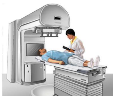
Figure 2: External Beam Radiation Therapy. [11]

External beam radiation therapy comes from a machine that aims radiation at your cancer. The machine is large and may be noisy. It does not touch you, but can move around you, sending radiation to a part of your body from many directions. External beam radiation therapy is a local treatment, which means it treats a specific part of your body. (Figure 2) For example, if you have cancer in your lung, you will have radiation only to your chest, not to your whole body. [11]