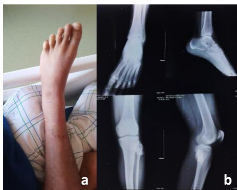
Figure 1: (a) Foot dorsiflexion deficit and (b) radiographic image of proximal tibial exostosis.

Following surgery, the patient was immobilized for 3 weeks and then underwent intensive physiotherapy to restore muscle function in the affected leg. Long-term follow-up over 12 months showed partial recovery of neurological deficits, with motor strength rated at 3/5.