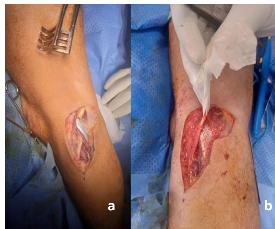
Figure 3: (a,b) Complete rupture of the common fibular nerve; terminoterminal suture of the common fibular nerve.

By the surgical procedure itself. Indeed, the fragility of the compression zone may make the nerve more susceptible to injury during surgical manipulation.