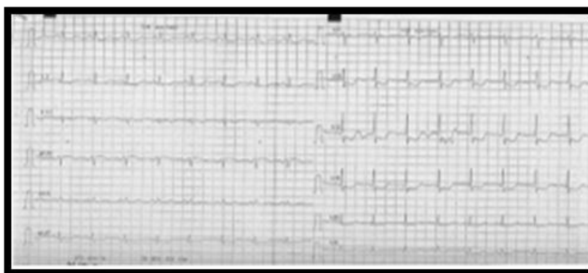
Figure 1: ECG.

She presents 9 months later in a picture of acute dyspnea with hemoptoic sputum. The clinical examination this time finds a tachycardia patient at 110 bpm with cardiovascular examination edema of the lower limbs. The ECG shows sinus tachycardia with an incomplete right branch block appearance. ETT reveals slightly dilated straight cavities with moderate HTAP.