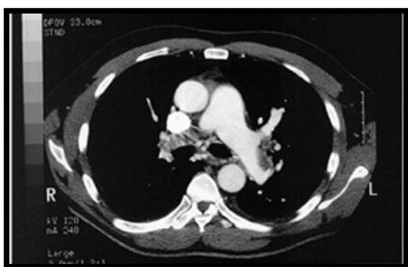
Figure 3: The thoracic angioscan.

An etiological assessment carried out finds a deficiency in antithrombin III (an activity at 19%). The patient was put on Sintrom. The control ETT, one year later, shows dilated biventricular cardiomyopathy in severe VG dysfunction.